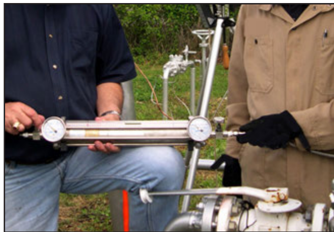
Sampling Natural Gas from the source is the best way to determine the gas composition.

An alternative technique to calibrate a flow meter for natural gas service is to calibrate using a well-defined gas and then use mathematic correlations to accurately correct the measurements in natural gas. One advantage of this technique is that