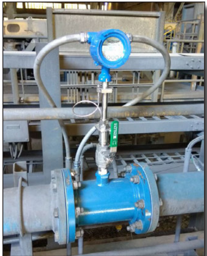
Fox Thermal Model FT4A thermal mass flow meter and temperature transmitter.

Further investigation at the factory confirmed the composition of the gas used to calibrate the flow meters was not representative of the actual flowing natural gas. This mismatch needed to be addressed, but the gas transporter also expressed a desire to set the gas composition in the field to reflect the actual gas composition based on region, all without sending the flow meter back to the factory for calibration. The user wanted to fix the identified problem, then later be able to periodically update for natural gas composition changes likely to occur over time.