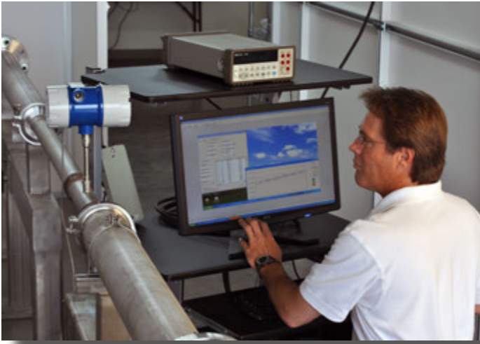
Calibration Technician performing an actual gas calibration in the flow laboratory.

Flow meter manufacturers can calibrate their natural gas flow meters using their own factory-standard natural gas surrogate. Calibrating with a surrogate representative of a typical NAESB analysis would seem appropriate, but some flow meter manufacturers reportedly calibrate or have calibrated their flow meters using surrogates containing 95 to 100 percent methane plus small percentages of ethane and/or nitrogen.