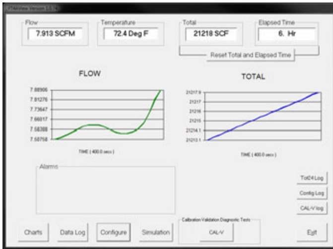
Sample screen view of the FT4A View™ software tool used to configure the Model FT4A and analyze data on flow and temperature of gas.