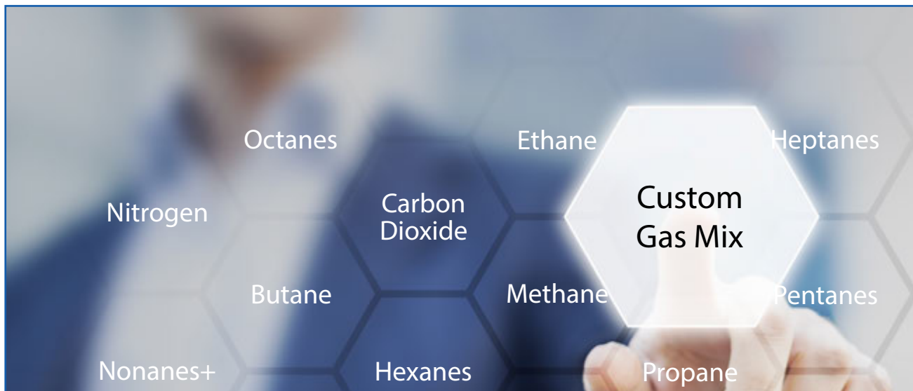
The manufacturer offers in-the-field custom gas mixture creation for gas composition changes by programming the flow meter directly.

The manufacturer used the actual natural gas compositions to perform calculations that confirmed the flow measurement errors were similar to those experienced by the transporter. The traditional approach to resolve this problem would be to return the flow meters to the factory for recalibration with various surrogate gases representative of the various natural gas streams. This was not acceptable to the transporter in the short term and would have made compensating for future composition cumbersome in the long term.